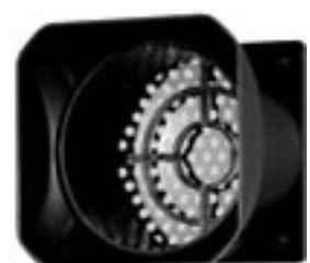
Variable Intel Prescott air duct included