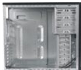
Longer cables and space for 11 drives