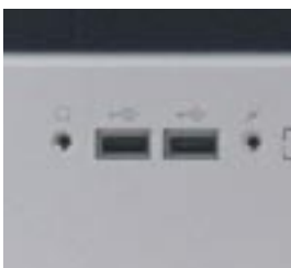
2 x USB 2.0 and 2 x audio connectors in front