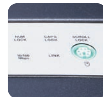
Extra PS/2 Mouse Port