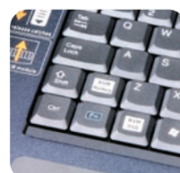
Dedicated OSD and OSD Toolbar Invocation Keys