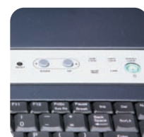
Port Up/ Port Down Switches